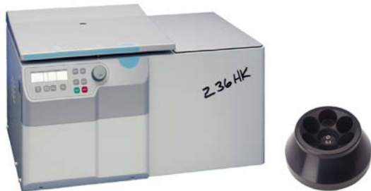
Refrigerated High-Speed Centrifuge Z 36 HK

max. Speed: 18000 rpm max. Volume: 4 x 100 ml Example rotor: Swing out rotor 2 x 3 Microtitreplates