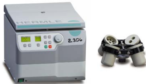
Universal Centrifuge Z 306

max. Speed: 15000 rpm max. Volume: 44 x 1,5/2,0 ml Example rotor: Angle rotor 24 x 1,5/2,0 ml