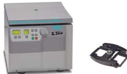
Universal Centrifuge Z 326

max. Speed: 18000 rpm max. Volume: 4 x 100 ml Example rotor: Swing out rotor 4 Places