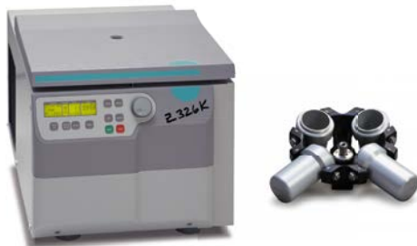
Refrigerated Universal Centrifuge Z 326 K

max. Speed: 13500 rpm max. Volume: 4 x 100 ml Example rotor: Swing out rotor 4 Places