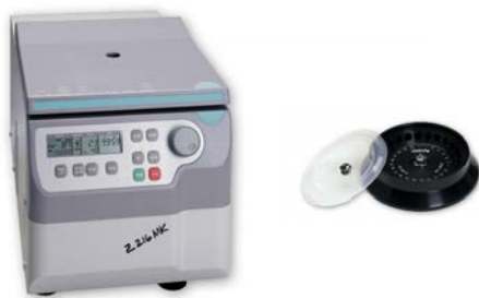
Refrigerated Microlitrecentrifuge Z 216 MK

max. Speed: 15000 rpm max. Volume: 44 x 1,5/2,0 ml Example rotor: Angle rotor 24 x 1,5/2,0 ml