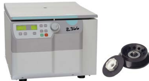
Universal Centrifuge Z 366

max. Speed: 30000 rpm max. Volume: 6 x 250 ml Example rotor: Angle rotor 6 x 250 ml